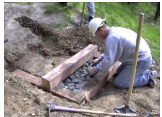
A volunteer improves Seattle's Seward Park. (2002)

7th National Trails Day! Stay tuned for VOW activities.